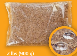
2 lbs (900 g) hydrophobic litter

Our patented hydrophobic litter has been used by thousands of veterinary clinics and hospitals in 44 countries worldwide since 2010.